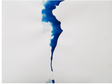
Marie Velardi, Land-Sea (Thailand 3) , 2017, pencil and watercolor on paper, 57 x 76 cm