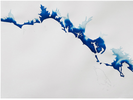
Marie Velardi, Land-Sea (Thailand 1) , 2017, pencil and watercolor on paper, 57 x 76 cm