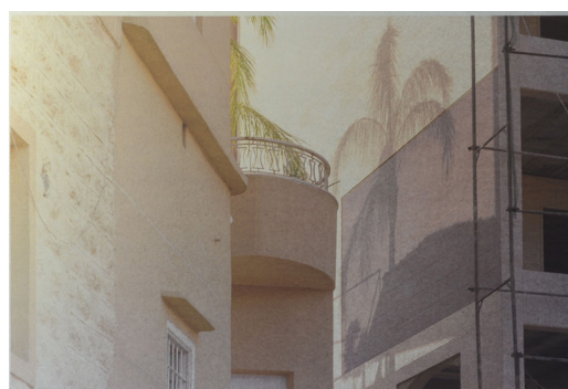
Aurélie Pétrel, Approche 4 , 2017, direct print on silver paper 40 x 60 cm, Edition of 3 + 2 AP

French artist Aurélie Pétrel revisits the role, status and nature of the image. For her, the photographic work is not a finished object: the same shot can be reused and approached from several angles depending on the context and the choice of the artist. Printed on various media, her images play with the traditional codes of the medium and the notion of photography. Thus, the artist gives a physical presence to her photographic works and invites the viewer to change his viewing perspective. Created in Beirut during a residency initiated by Byblos Bank in 2017, her series Approche (2017), born in an urban architectural context, seeks the limits of the possible: the imprints are so fine that the perception of the materiality of the works is changed, giving more the impression of a drape than of a print on paper.