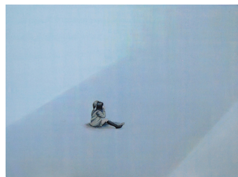
Tami Ichino, Untitled , 2018, acrylic on canvas, 80 x 110 cm

Attracted by what one does not see but which exists, Tami Ichino also raises the question of the senses: the subtle dialogues between the colors and the forms are an echo of our interiority.