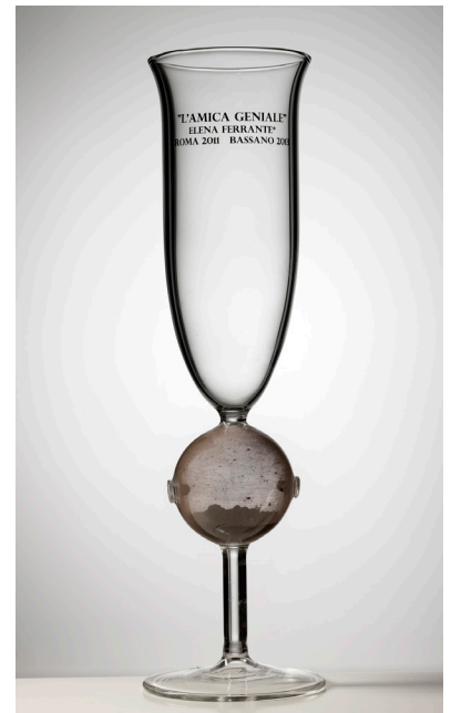
Antonio Riello, L'amica geniale (Ashes to Ashes) , 2013, blown borosilicate glass and book ashes, 38 x 11 x 11 cm