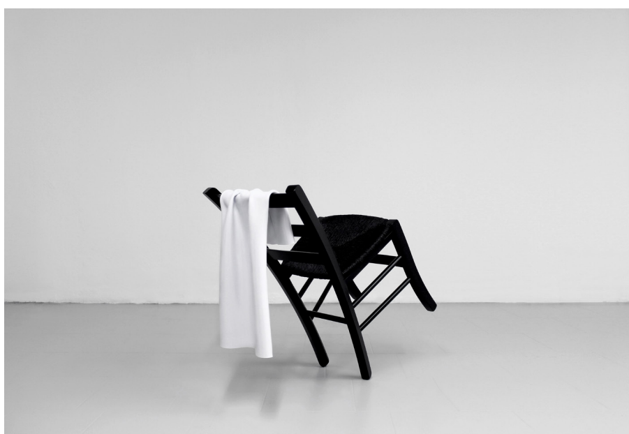
Gino Sabatini Odoardi, Senza Titolo con Sedia (Untitled with Chair) , 2016, polystyrene thermoforming, wood, straw, enamel, 40 x 80 x 90 cm

Defined as a state of balance between opposing forces, or a calm state of mind, equilibrium is a consistent aspect throughout the exhibition, deployed as the artist's metaphor to reflect intuitive impressions of balance or imbalance.