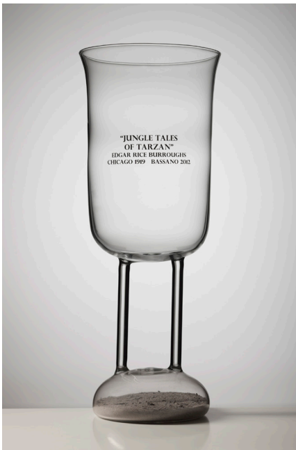
Antonio Riello, Jungle tales of Tarzan (Ashes to Ashes) , 2012, blown borosilicate glass and book ashes, 37 x 14 x 14 cm

Everyday objects, such as books housed in glass forms in Riello's Ashes to Ashes unconventional library, inspired by the tradition of venetian glass, as well as formal elements, like Cortinovis' lines or Sabatini Odoardi's draperies and Palladium floor plans are decontextualized, isolating their original function. Furthermore, the works observe contradictions and opposing emotions. The three artists transform such material into ideal subjects of experimentation, exploring differing degrees of tension, often by way of ordered variations in compositions of subtle, asymmetrical balance. The outcome is surprising, eccentric, improbable, even enigmatic.