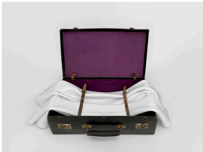
Gino Sabatini Odoardi, Senza titolo con valigia (Untitled with suitcase) , 2023, polystyrene thermoforming, wood, velvet, leather, aluminum, 36 x 64 x 44 cm

The selected works of Cortinovis, Riello and Sabatini Odoardi embody the idea of equilibrium's conceptual mobility, striving to hold a vital balance between all contrasts. In Cortinovis' Au plus près de ma ligne (Closest to My Line) series, drawn lines on paper are a physical and metaphoric attempt to maintain a direction, while Sabatini Odoardi's Untitled with Chair sculpture rests upon a fragile point of stability.