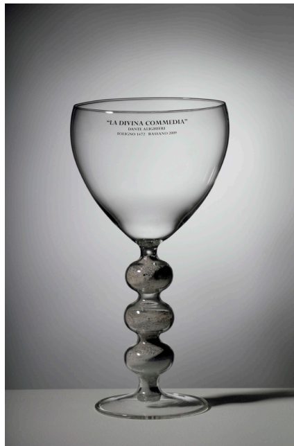
Antonio Riello, La divina commedia (Ashes to Ashes) , 2009, blown borosilicate glass and book ashes, 36 x 15 x 15 cm