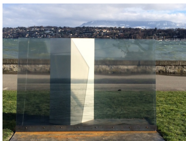
Mai 2014, 2014, print, encapsulated polyester film, secured glass, steel, 300 x 300 x 180 cm

Figurative or abstract, her work examines the process of the materialization of ideas and its implementation. As a dialectic of the same and the different, she shows without ever repeating, reveals what is there; the initial trigger gives the impulse of a writing as in a musical score, it is the first movement which makes possible all the following ones.